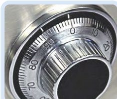
Combination - PS