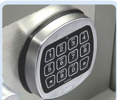
Digital Ross 1000